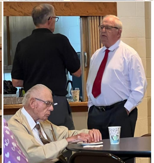
Father's Day Celebration at First Presbyterian Church